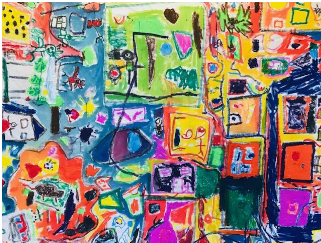
A map of our wonderful school draw by Reception supported by Ms Sawyer