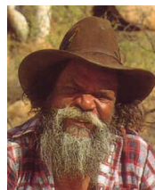
Clifford Possum Tjapaltjarri