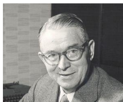
Ole Kirk Christenson