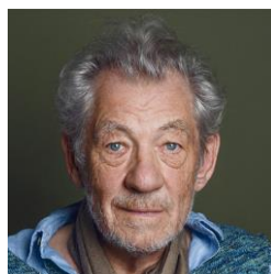
Sir Ian McKellen