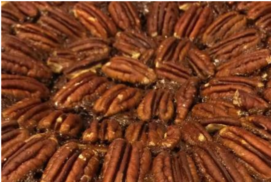
Pecan Pie from Missouri

https://www.allrecipes.com/recipes/17425/us-recipes/us-recipes-by-state/